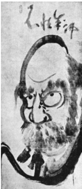
Bodhidharma. By Hakuin Zenji (1683-1768) Yamamoto Collection.