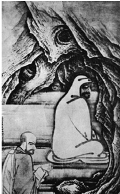
Bodhidharma and Hui-k'e. By Sesshu (1420-1506).