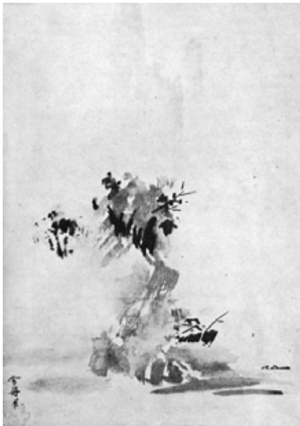
Haboku Landscape. By Sesshu (1420-1506). Tokyo Museum.

The monastic “tea ceremony” was introduced into Japan by Eisai, and though its form is different from the present cha-no-yu, it was nonetheless its origin, and appears to have been adopted for lay use during the fifteenth century. From this the cha-no-yu proper was perfected by Sen-no-Rikyu (1518–1591), and from him descend the three main schools of tea now flourishing. Ceremonial tea is not the ordinary leaf tea which is steeped in hot water: it is finely